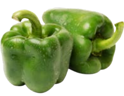
FLORIDA GREEN BELL PEPPERS 5/$5