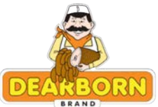
DEARBORN BRAND DEARBORN BEER SALAMI $6.49/LB.