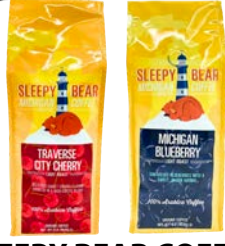
SLEEPY BEAR COFFEE CO. 1LB GROUND BAGS ALL FLAVORS $11.99/EA.