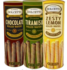
DOLCETTO WAFERS 3 OZ TIN ALL FLAVORS $2.99/EA.