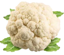
CALIFORNIA CAULIFLOWER 2/$6