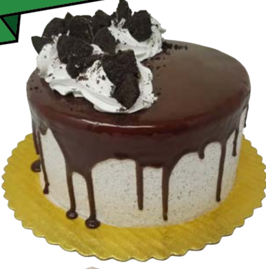
CHEF'S FEATURE CAKE OREO $26.99 / 6" | $39.99 / 8"