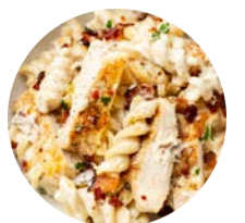
CHICKEN BACON RANCH $7.99/LB.