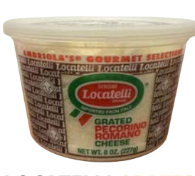
LOCATELLI GRATED PECORINO ROMANO 8 OZ $12.99/EA.