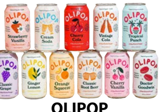
OLIPOP PREBIOTIC SODA ALL VARIETIES $2.29/EA.