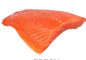
FRESH RUBY RED TROUT $12.49/LB.