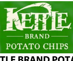
KETTLE BRAND POTATO CHIPS FAMILY SIZE ALL VARIETIES $6.99/EA.