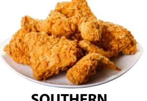
SOUTHERN FRIED CHICKEN $9.99/LB.