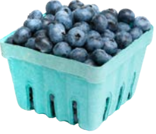
CRISP & SWEET BLUEBERRIES 2/$6