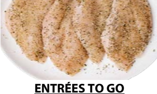
ENTRÉES TO GO ITALIAN CHICKEN CUTLETS $4.69/LB.