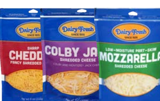
DAIRY FRESH SHREDDED CHEESE 8 OZ. ALL VARIETIES $1.99/EA.