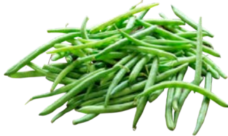
FLORIDA GREEN BEANS $1.69/LB.