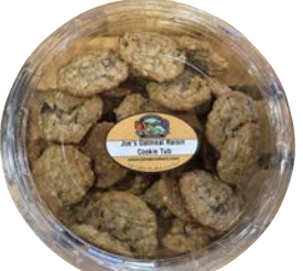
JOE'S COOKIE TUBS ALL VARIETIES $9.99/EA.