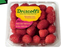
DRISCOLL'S RASPBERRIES 2/$6