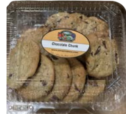
CHOCOLATE CHUNK COOKIES $6.99/EA.