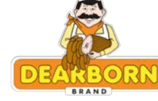
DEARBORN BRAND DEARBORN OVEN ROASTED TURKEY $6.99/LB.