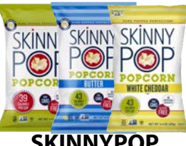
SKINNYPOP POPCORN ALL VARIETIES $3.99/EA.