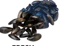
FRESH MUSSELS 2 LB BAG $7.99/EA.