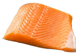
FRESH ATLANTIC SALMON FILLETS $12.99/LB.