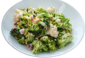
BROCCOLI CRUNCH $9.99/LB.