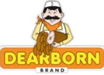
DEARBORN BRAND DEARBORN ROAST BEEF $8.99/LB.