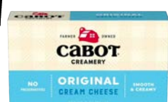
CABOT CREAM CHEESE BLOCK 8 OZ $1.99/EA.