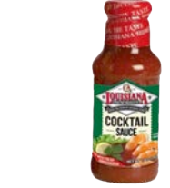
LOUISIANA COCKTAIL SAUCE $2.99/EA.