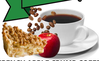
FRENCH APPLE CRUMB COFFEE COFFEE FLAVOR OF THE WEEK $7.99/LB.