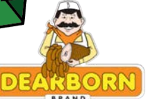
DEARBORN BRAND DEARBORN BROWN SUGAR HAM $6.49/LB.