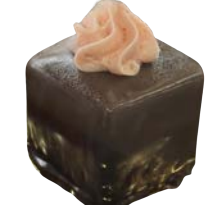
CHOCOLATE DECADENCE $1.99/EA.