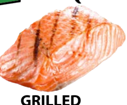
GRILLED SALMON $24.99/LB.