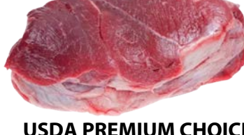
USDA PREMIUM CHOICE ENGLISH ROAST $8.99/LB.