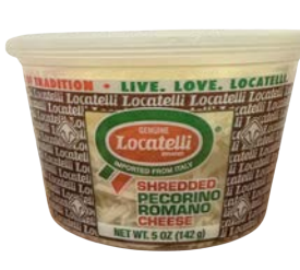
LOCATELLI SHREDDED PECORINO ROMANO 5 OZ $8.49/EA.