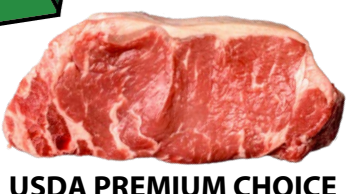
USDA PREMIUM CHOICE NEW YORK STRIP STEAK $12.99/LB.