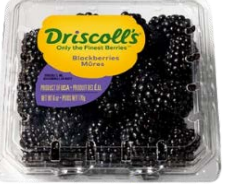
DRISCOLL'S BLACKBERRIES 2/$6