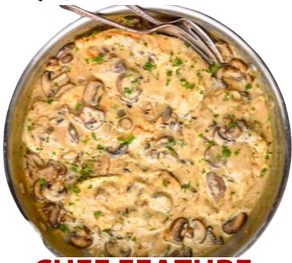
CHEF FEATURE GRAB 'N' GO CHICKEN MARSALA $6.99/LB.